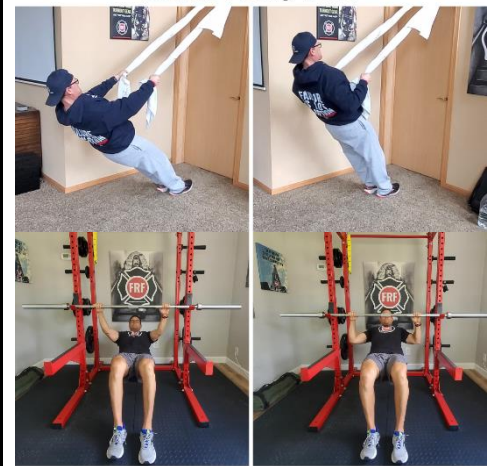
Bodyweight Rows (bar option) You can also use a TRX or webbing Row